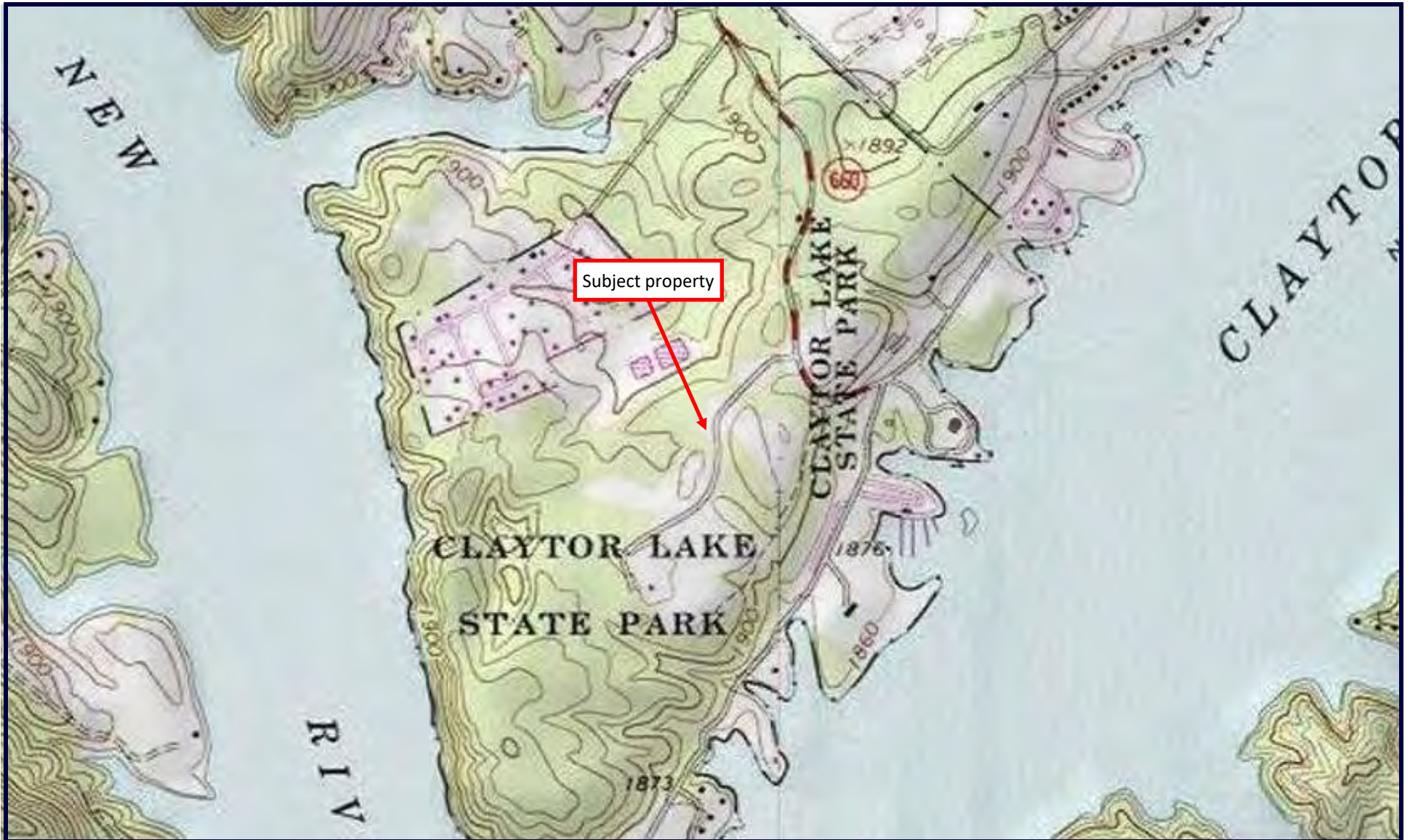
Figure 1c: USGS Topographic Map