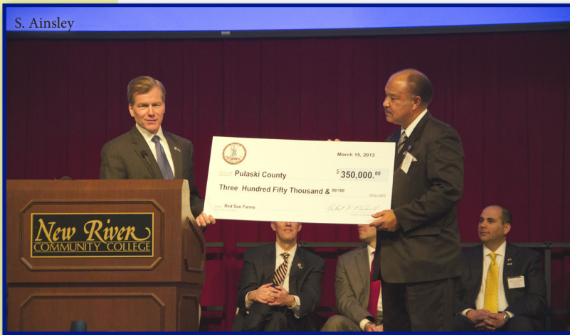
Governor McDonnell provided support via the Governor's Opportunity Fund to help Red Sun Farms to locate in the NRV Commerce Park.