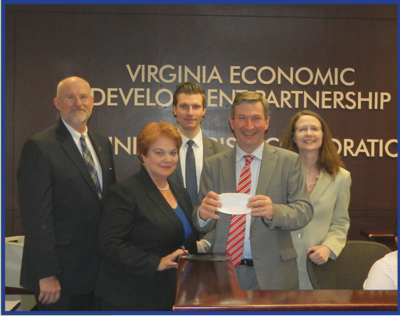
BC Genesis will be the first tenant of the Floyd Innovation Center, built with Economic Development Administration, Appalachian Regional Commission, and Tobacco Commission funds.

The full document found at www.nrvpdc.org contains an economic overview of the New River Valley; including a brief history, current trends, and up-to-date data on the region. Goals and objectives are designated based on this evaluation and projects are identified by a Comprehensive Economic Development Strategy Committee, made up of a majority of private sector participants as well as public sector representatives. Projects included in the CEDS demonstrate priorities in the region. Some familiar projects with a portion of EDA funding are Virginia Tech's Corporate Research Center, NRV Commerce Park Water and Sewer project, and the Carilion Giles Memorial Hospital.