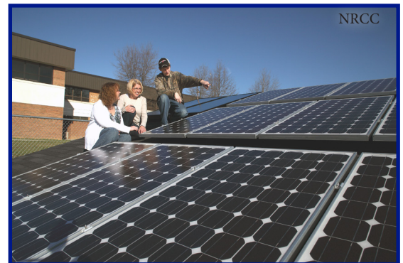
New River Valley workforce training for jobs of the future.