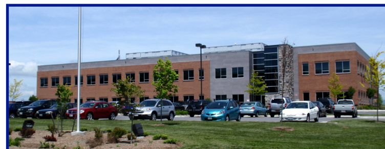
Virginia Tech Corporate Research Center: Virginia Tech is a Top 30 Public Research University according to the National Science Foundation.

*BEA reports a combined PCPI figure for Montgomery County and Radford City