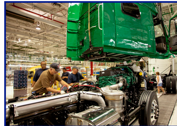
Employees assembling truck cabs at the Volvo plant in Dublin.

Source: Weldon Cooper Center, July 1, 2015 Population Estimates for Virginia and its Counties and Cities