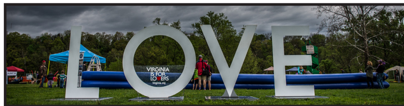
The 2017 Outdoor Expo was held at Bisset Park in Radford, VA

Source: Virginia Employment Commission, and Bureau of Economic Analysis, Per Capita Personal Income by County *BEA reports a combined PCPI figure for Montgomery County and Radford City