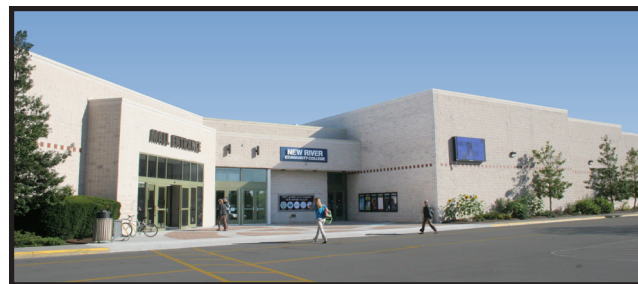
Students entering the NRCC Christiansburg campus location.